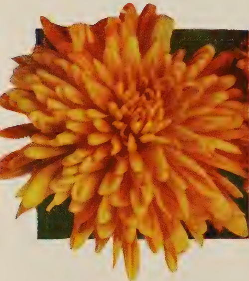
MRS. P. S. DU PONT III 60c each; 3 for $1.50

10 Popular Mums All tried and proved kinds that are sure to thrive in your garden. 10 Sure-to-Bloom Plants $4.80 (1 of each pictured)